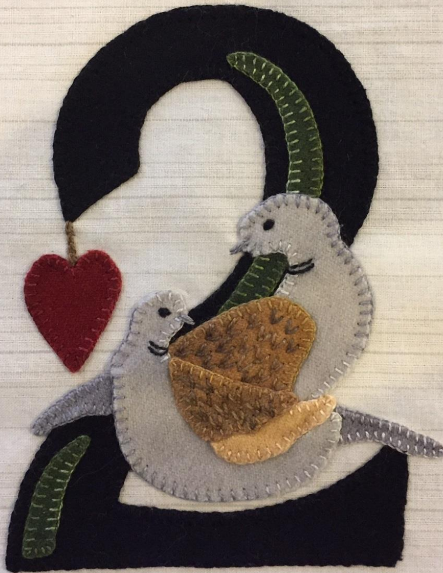
Twelve Days of Christmas - Block 2 - Two Turtle Doves

© 2018 - Gail Grassel - River's Edge Antiques & Quilt Loft - Hayward, WI